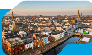
Exploring Cork's Neighborhoods