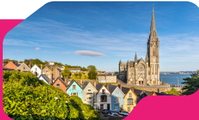
Museums & Galleries