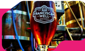
Pubs & Live Music