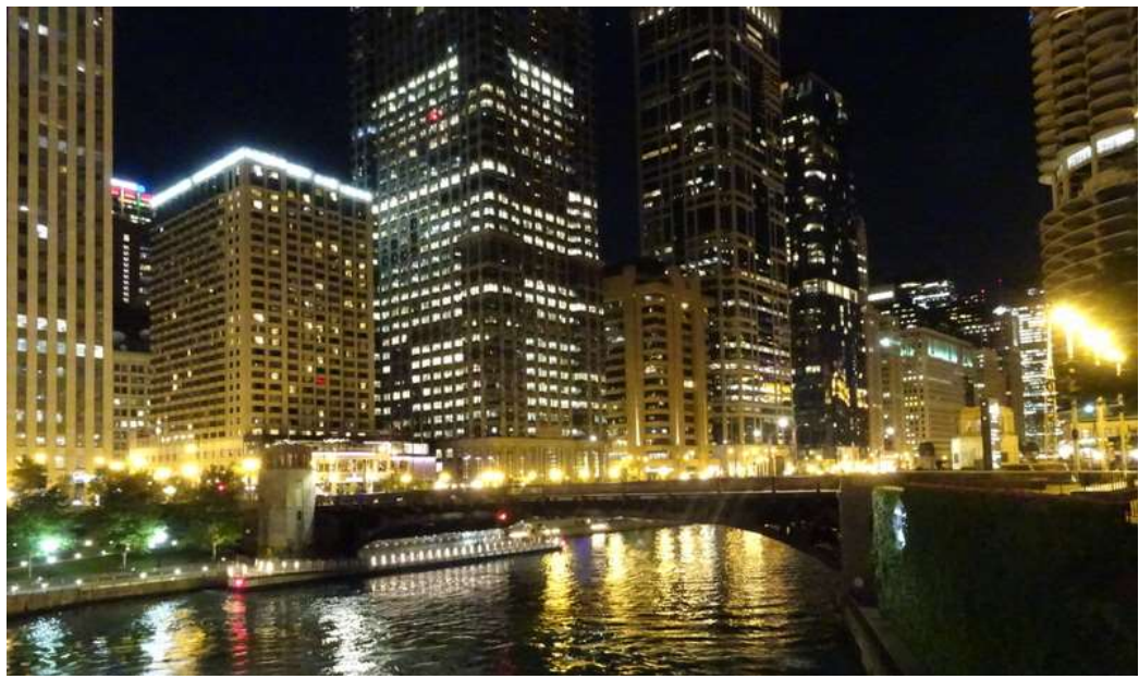
Chicago, IL, USA – Meeting Site for 2017 ISAPP Conference